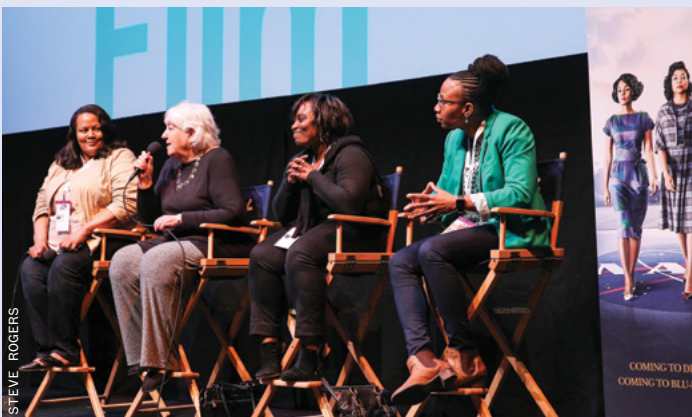
STEVE ROGERS Hidden Figures film screening and Q&A